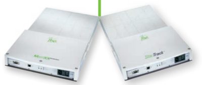
Connect your existing MatrixXX or StarTrack detectors